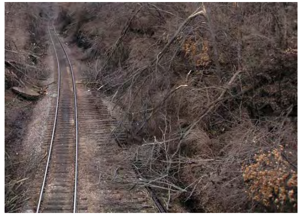
Figure 9. Thickets of brushy cover such as along this railroad track (after an ice storm) improve habitat availability and offer bobwhites and cottontails protection from predators.

In large fields or along right-of-ways, thickets of shrubs (Figure 9) such as blackberries or wild plum afford cover for cottontails, songbirds and