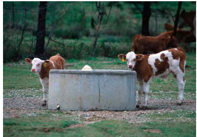
Figure 20. Farm Bill programs provide cost-share support for alternative water sources to keep livestock from ponds and streambanks.

Many wildlife species depend on wooded areas along streams for part or all of their habitat needs. Trees stabilize and protect streambanks and drainage ditches from erosion and sedimentation. A lack of trees can raise water