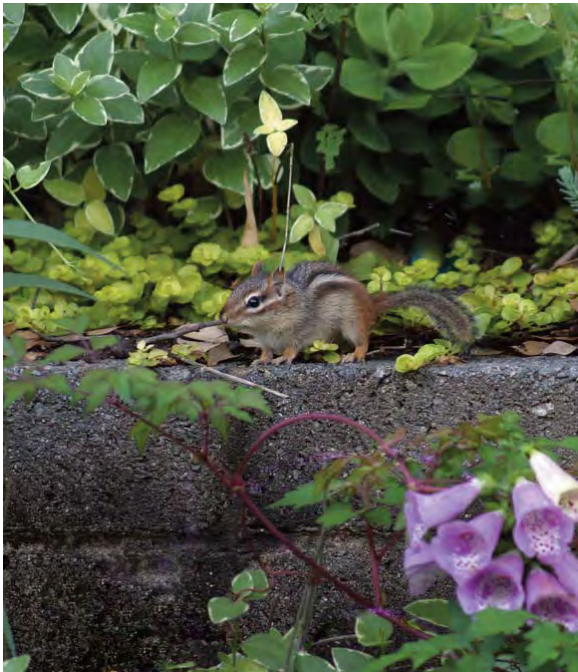
Figure 23. Idle areas are inhabited by a number of wildlife species.