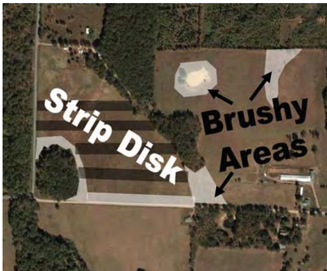
Figure 2. Mapping your habitat will help identify areas needing improvement.

to keep grasslands in an early successional stage. The sequence of when these disturbances occur should be written in the plan and labeled on the map.