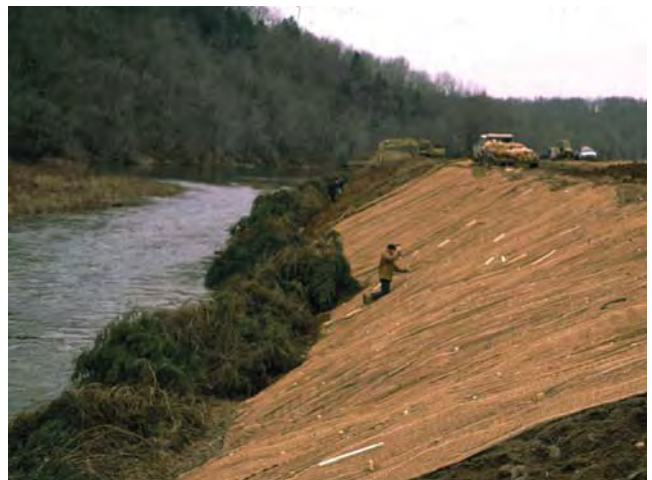
Figure 21. Restoring vegetative buffers, as shown before and during restoration, will reduce stream sedimentation and improve wildlife habitat. This private lands project was partially funded by the Arkansas Game and Fish Commission.