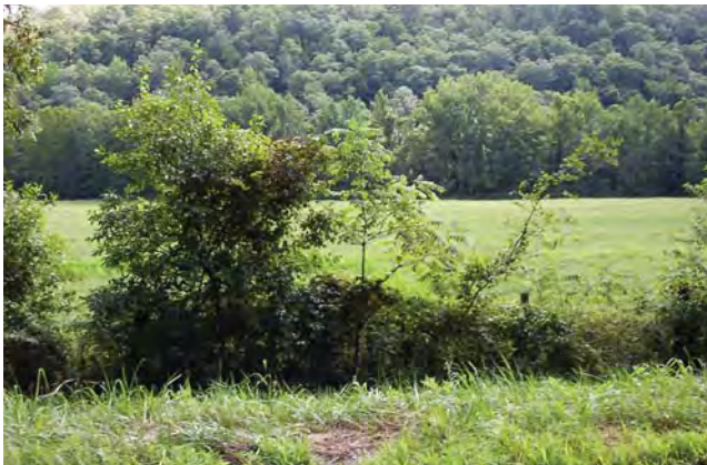
Figure 4. A brushy fencerow provides travel and escape cover for cottontails, songbirds and bobwhites.

Woody fencerows next to crop fields or pastures (Figure 4) provide many of the same benefits as windbreaks. Natural woody fencerows can be encouraged by not spraying or mowing next to the fence. When protected from clipping, fencerows can develop into natural travel lanes for wildlife. Plant clumps of trees and shrubs or spread seeds of vines and shrubs along fencerows to encourage plant growth.