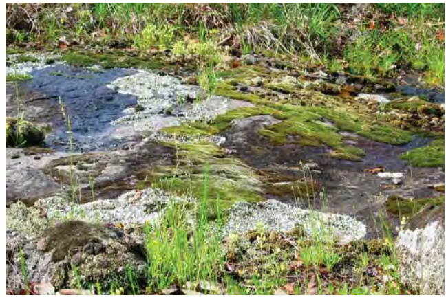
Figure 22. A unique nepheline syenite glade in Pulaski County, Arkansas.

Glades (Figure 22) are rocky, open areas with exposed rock and little or no soil. These areas have no tree canopy and very few shrubs. Glades vary by soil depth, type of bedrock, moisture and