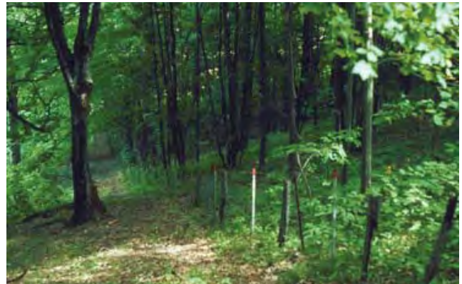
Figure 15. Vegetation on the ungrazed side of the fence (right) is thicker and provides more wildlife habitat than on the left where cattle grazing has removed understory vegetation.

species (Figure 15). Fences will safeguard the woodlands from soil compaction and depletion of wildlife foods by domestic livestock. Additionally, soil erosion increases as grazing pressure increases in forests (Table 2). Typical forests provide only marginal forage value for cattle. If forests must be grazed, consider using rotational grazing or seek information about agroforestry practices from the USDA National Agroforestry Center or the University of Missouri Center for Agroforestry.