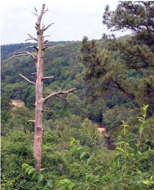
Figure 14. Snags provide feeding and nesting areas for woodpeckers, squirrels, bluebirds and black bears.