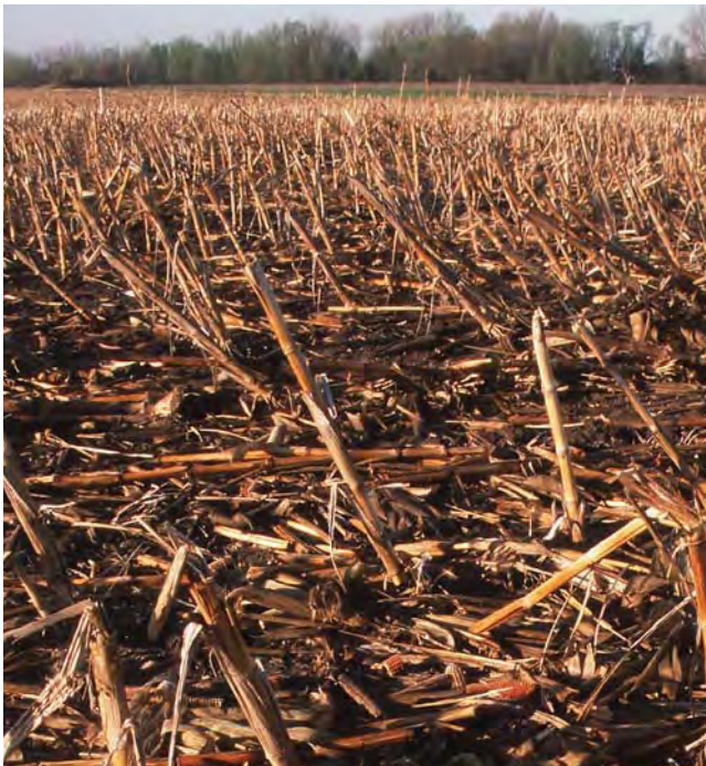
Figure 3. Residue from this corn crop will reduce soil erosion and benefit wildlife.

Residues from conservation tillage provide both food and cover for wildlife (Figure 3). In particular, waste grain and weed seeds left after harvesting are staple foods for wildlife in winter.