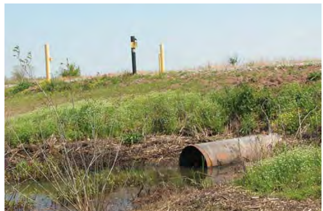
Figure 17. A water-control structure is an essential tool for creating habitat for amphibians, reptiles, shorebirds and waterfowl.

Relying on rainwater to fill wetlands is risky and unpredictable, though it can be done. Having water-control structures for manipulating water levels is an important tool for effective wetland management (Figure 17). Water levels can be manipulated to improve the predictability of plant responses and control undesirable, invasive weeds. Moist soil areas may need to be disked and/or burned at two- to three-year intervals to control invasion by undesirable plants. Disk and/or burn as early in the spring as possible to allow time for rainfall and seed germination.