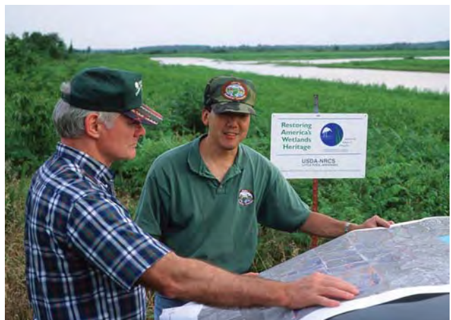
Figure 25. Assistance is available from several natural resource agencies for managing wildlife habitat.

Following is a brief description of natural resource professionals (Figure 25) and how to contact them, books and guides, and fact sheets pertaining to wildlife and forest management in Arkansas.