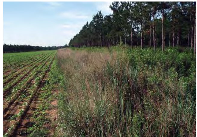
Figure 13. A gradual edge offers more plant diversity and escape cover for wildlife than an abrupt edge.

competition to increase pine tree growth and yield. In a wildlife-friendly pine forest, plantations need to be thinned as soon as economically feasible to open the forest floor to sunlight and encourage understory plant growth (Figure 13). Pine production that is lost through understory and mid-story plant growth will need to be balanced with the gain in wildlife habitat.