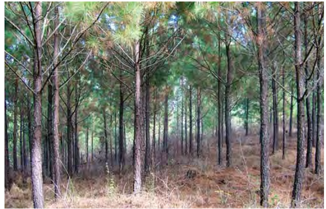
Figure 11. This nine-year-old natural pine stand has little understory with limited food and cover for wildlife.

opened, sunlight will generate a plant response serving as browse and cover for a variety of wildlife. Always leave an ample number (3-6 per acre minimum) of den or cavity trees (Figure 11). These standing dead or dying trees harbor insects which provide food for woodpeckers, songbirds, flying squirrels and a number of wildlife species. If your wildlife objective is directed at species depending on tree cavities, protect even more of these trees.