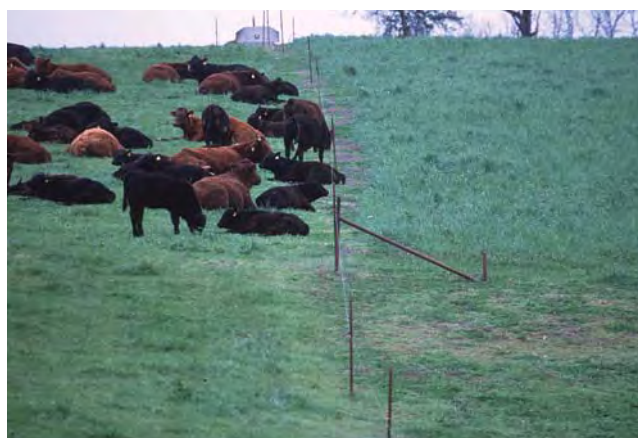
Figure 7. Arkansas cattle grazing on the left side of the fence will be moved to the other side in a rotational grazing schedule.

Grazing affects the plants and soil in pastures and consequently affects wildlife. Livestock are selective about the plants they eat. They tend to graze some plants repeatedly and ignore others. This may weaken the more desirable plants and allow unwanted plants to thrive and multiply. Proper grazing management involves keeping desirable plants healthy so stands are adequate to support livestock and benefit wildlife (Figure 7). Stocking rates are adjusted to avoid overgrazing and damaging grasslands.