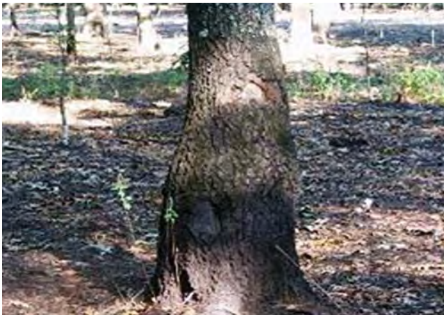
Figure 18. The swollen trunk of this water-intolerant tree indicates extended flooding and could result in tree mortality.

Tree composition and density should be considered when flooding forests for waterfowl. Different species of oak trees should be encouraged and cavity trees made available for wood ducks, woodpeckers and other cavity-nesting wildlife. Low-valued trees can be removed to make room for better mast producers. All den trees should be retained. A few standing dead trees may provide desirable nest sites for wood ducks and other cavity-nesting wildlife.