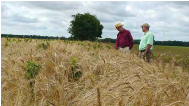
Figure 1. Your local county Extension agent can suggest soil amendments based on a soil test, herbicide recommendations to control invasive plants and other methods to improve wildlife habitat on your property.

Whether you own five or five thousand acres, implementing a few habitat improvements on your property can help wildlife. This handbook introduces ideas for improving your land for wildlife and provides sources for additional information. Some habitat practices are fairly simple while others require contacting a private lands biologist, forester, Extension agent, district conservationist or other professional for assistance (Figure 1). Contact information for assistance and additional resources are listed at the end of this handbook.