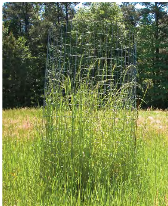
Figure 24. Set up a small enclosure cage to visually inspect plant productivity and the effect of wildlife consumption.