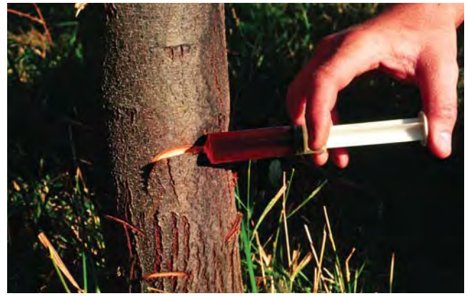
Figure 12. “Hack and squirt” is an herbicide method for removing undesirable trees and shrubs.

and other wildlife and are the next generation of the forest. However, trees growing from sprouts often do not produce merchantable timber.