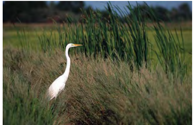
Figure 16. Many waterbird species such as this Great Egret inhabit wetlands.

Wetlands are biologically rich with a greater diversity of plants and animals compared to drier habitats. Wetlands are home for waterfowl, shorebirds and songbirds (Figure 16). Natural wetlands along streams and rivers are important fish spawning and rearing areas. Many wetlands in Arkansas are constructed wetlands; that is, they were developed on previously dry or