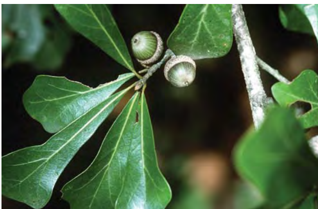
Figure 10. Acorns are one of the best all-around food sources for over 100 wildlife species including deer, turkey, squirrels, blue jays and black bears. Water oak photo by Robert H. Mohlenbrock @ USDA-NRCS PLANTS Database.

Hardwood forests should be thinned periodically by choosing individual trees for harvesting. Thinnings should favor the maintenance and improvement of oak, hickory, blackgum, cherry, dogwood and persimmon. As the forest floor is