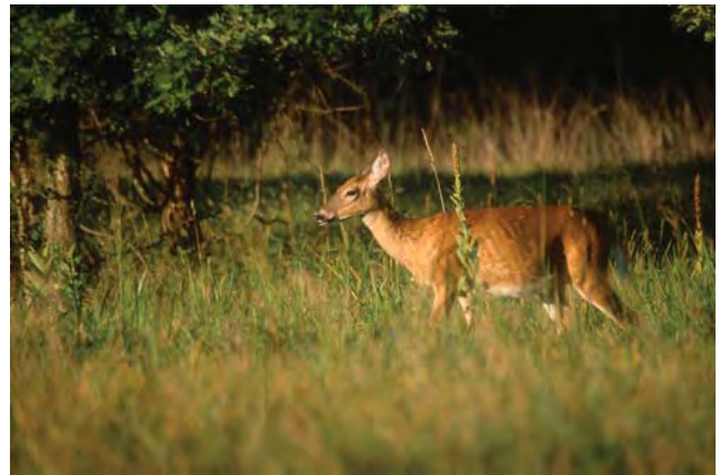
Figure 6. Warm-season grasses provide cover for many wildlife species including songbirds and deer.

Grasslands provide many kinds of wildlife with food and cover. The grasshopper sparrow and meadowlark are open grassland nesters. Cottontails, bobwhites and turkeys also nest in grasslands but prefer areas near woods or brush (Figure 6). Grasslands also control soil erosion.