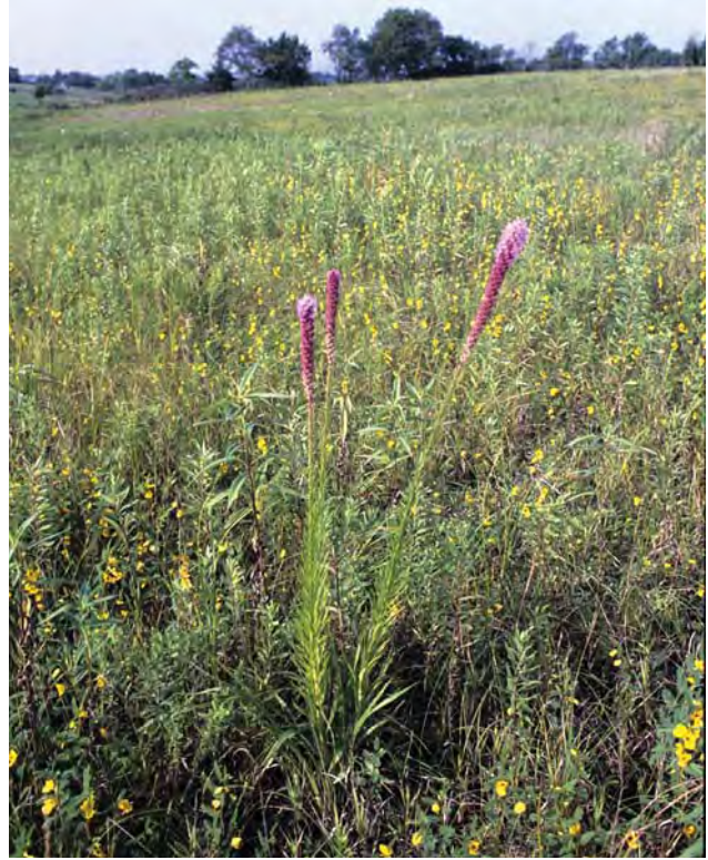
Figure 19. This disked field yielded new plant growth which provides habitat for butterflies, songbirds and mammals.