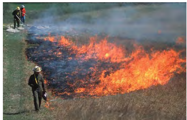
Figure 8. A newly burned field provides bugging areas for bobwhites, turkey and songbirds and stimulates new plant growth.

Prescribed burning (Figure 8) is one of the most beneficial practices for improving wildlife habitat; however, its application is often limited where soil erosion, safety and legal aspects are of